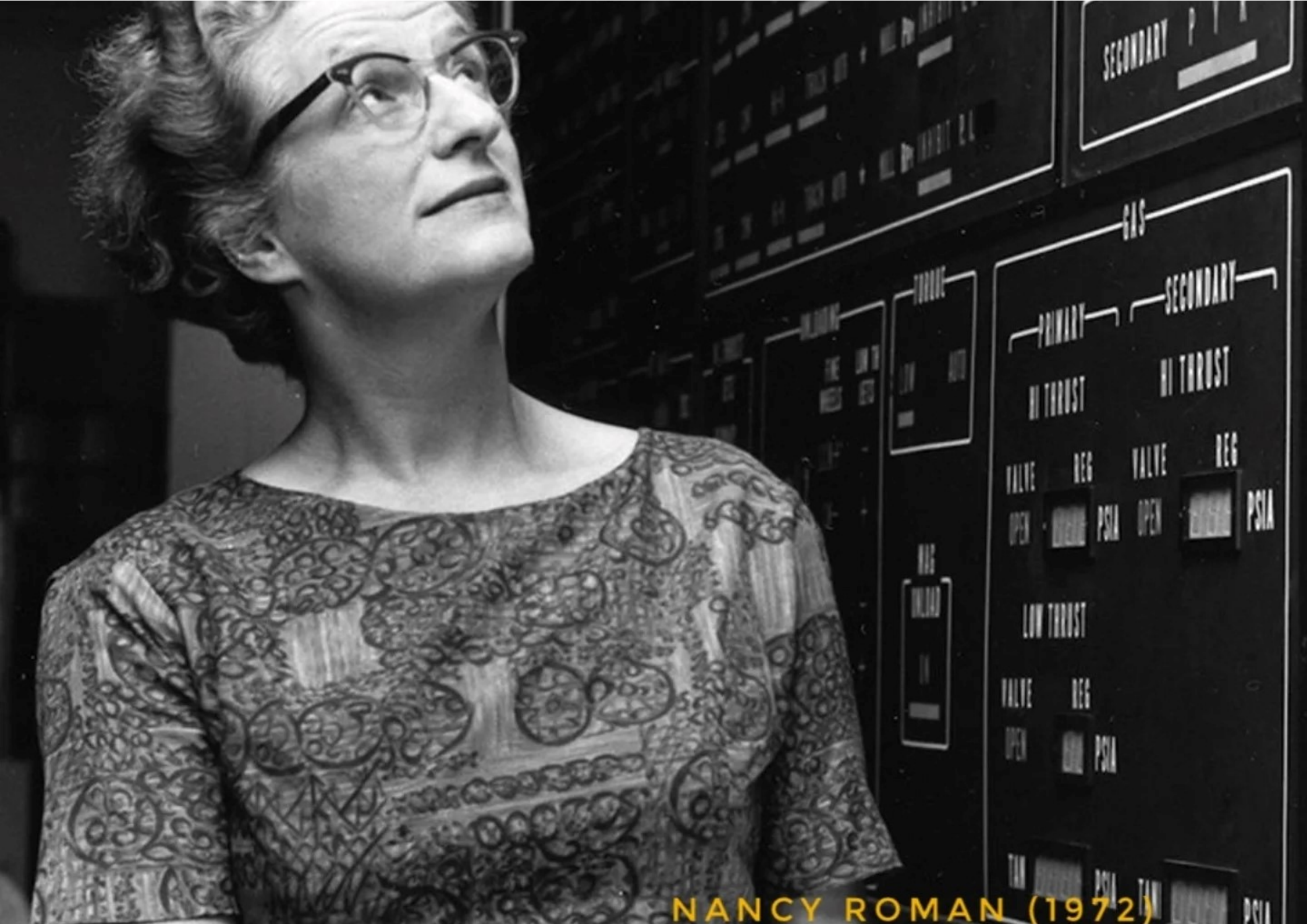
NANCY ROMAN (1972)